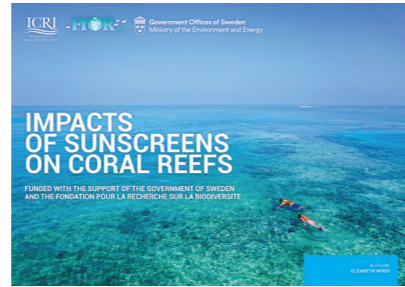
Impacts of sunscreens on coral reefs